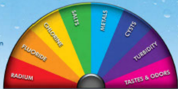
Reverse osmosis systems remove the entire spectrum of harmful contaminants.

Reverse Osmosis (RO) drinking water systems include mechanical filtration to remove particles, carbon absorption and absorption to remove chlorine, taste, odor and chemical contaminants, as well as membrane separation down to .0001 microns. RO membranes remove dissolved solids at the ionic level. No other purification system can provide better removal. Reverse Osmosis Systems provide the best quality drinking water for your family.